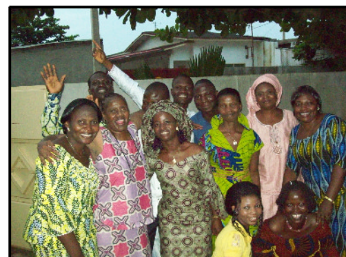
Staff following end-of-year program

Please remember our Annual Sponsorship Dinner being held at Deliverance Evang. Church September 18th 2010 @ 4:00 p.m. If interested please contact: Yvonne Carter @ 215-438-6360 or Yvonne DuBrey @ 215-848-0148