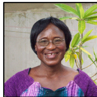
Parents accepting Christ