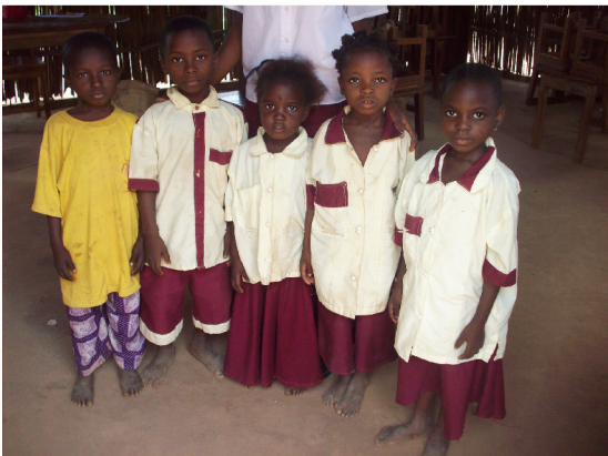
The "We Need Shoes" Drive - A Success