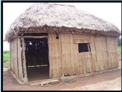
Our First School Building in Benin