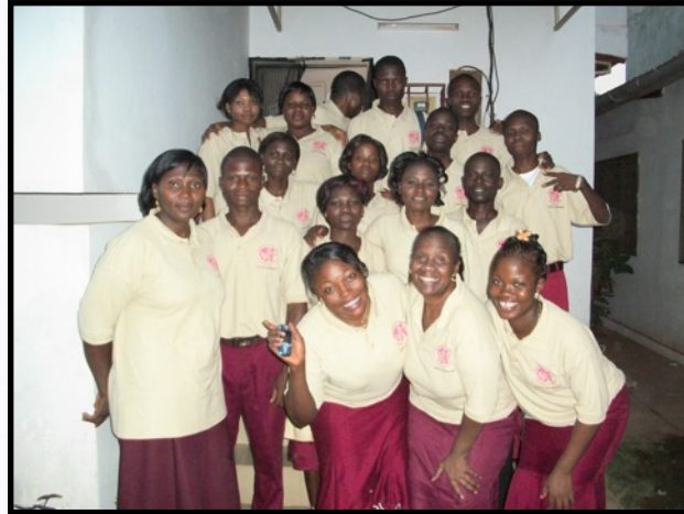
"The Benin Staff and I wish you a great Summer"

I hope and pray this newsletter finds each of you blessed in the Lord and prospering in the things of the Lord. I praise God for His faithfulness and for all he has ever done, is doing and yet has in mind for His ministry. I continue to count it a privilege to know Him and make Him known.