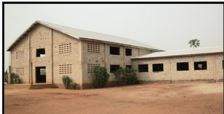
The New Church & School Building in Benin

And He's not finished yet, floors, smoothed walls, windows and doors will be coming too in His time, because what He begins, He finishes. This is a generation that is being educated and raised up to know Jesus and through them, change will come to this nation.