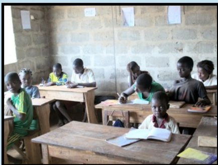
The New Class Rooms